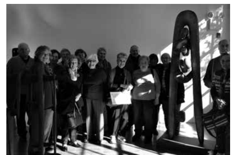
Chaverim museum visit